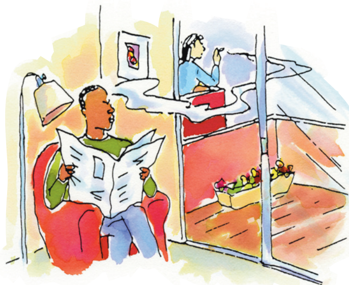
Illustrations by Janet Cleland © California Department of Public Health

As a general rule, it is unwise to file a lawsuit unless you have suffered significant harm. Your chance of convincing a court that you have a justifiable legal claim is far better if you can show that you have been harmed badly by repeated, unwanted exposure to secondhand smoke in your apartment—for instance, if you have visited a doctor with frequent respiratory complaints, missed work due to illness caused by the smoke, stayed away from